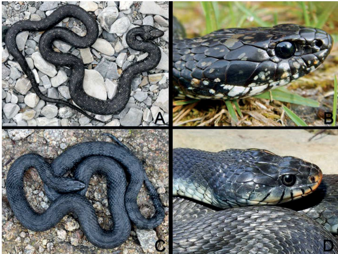
Fig. 1 — Examples of picturata (A-B) and charcoal (C-D) melanistic forms in Natrix helvetica : dorsal view of a N. b. sicula from Emilia-Romagna (A); head detail of a N. b. sicula from Tuscany (B); dorsal view of a N. b. cetti from Sardinia (C); head detail of a N. b. sicula from Sicily (D).

the Societas Herpetologica Italica , from the platforms of Citizen Science, Ornitho.it and iNaturalist, and from social networks (mainly via the Facebook groups “Identificazione Anfibi e Rettili” and “Fauna Siciliana”). Other records were obtained from the scientific literature. The resulting dataset contains all coordinates and localities for all sources. Whenever localities were mentioned and clearly described but GPS coordinates were not provided, that information was tracked and obtained by Google Earth Pro software (version 7.3). Such extrapolated coordinates were not used in the extraction of elevation data for our analyses. When available, information was collected on the characteristics of the individual, such as sex and measurements. Snake images were examined to obtain information on the coloration in order to distinguish the different degrees of melanism. Within the chromatic variability of melanistic individuals we have identified two main forms of melanism (Fig. 1). Reference can be made to the picturata color morph (see JAN, 1864; HECHT, 1930; MERTENS, 1947), which consists of an intense black coloration with a variable amount of pale dots scattered over the entire surface of the body, the iris is