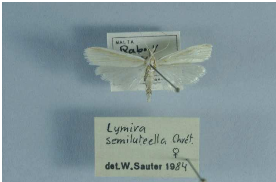
Fig. 1 — MALTA (♀) Dwejra, l/o Rabat, [35°54 21 N; 14°22 52 E 200m.] 10.v.1983 Sammut leg. [originally determined by W. Sauter as Lymira semiluteella ] [GP Slamka 2139].