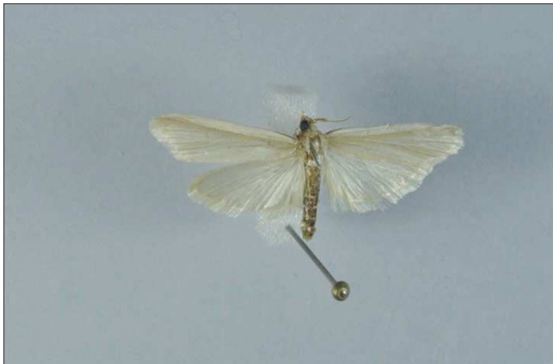
Fig. 2 — (♂) Mellicha, il-Kortin, 15.vii.2006 H. Borg-Barthet leg.