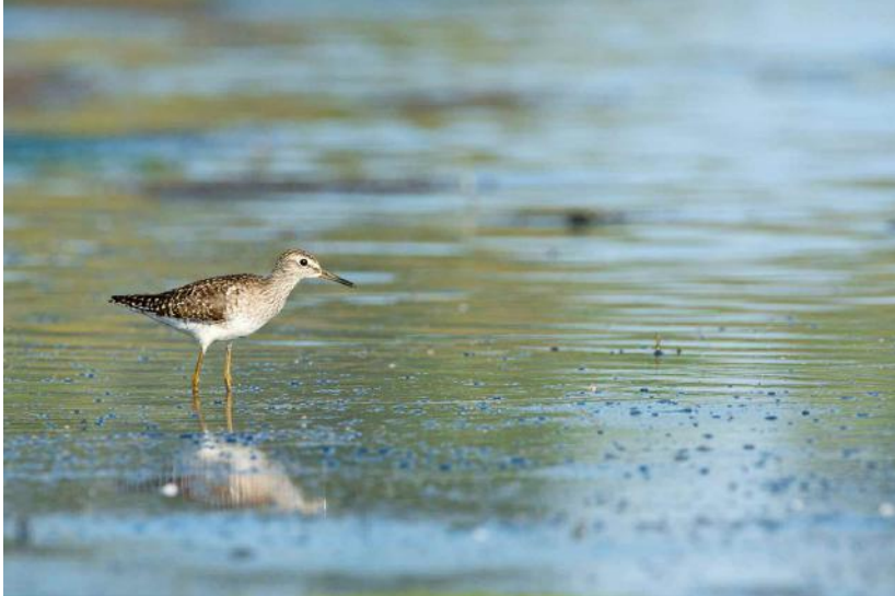
Fig. 3 — Wood Sandpiper Tringa glareola.