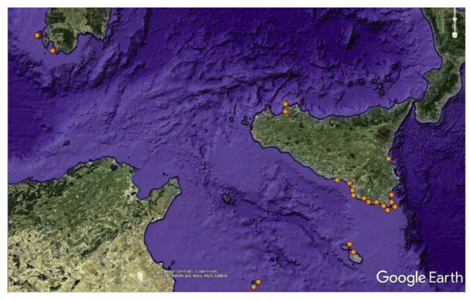
Fig. 2 — Indicative location of Natura 2000 sites on central Mediterranean islands that harbour B. megacephalus populations (source: CASSAR et al. , 2017). Beyond these Natura 2000 sites, the species is also known from the islands of Lipari and Vulcano (Aeolian Islands) (MASSA, 2011).