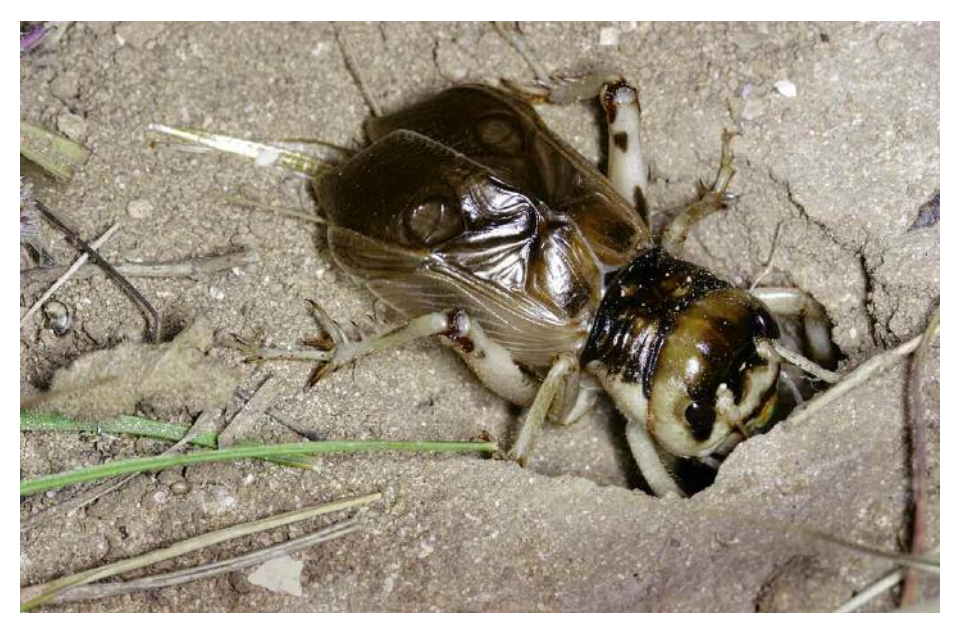
Fig. 1 — Brachytrupes megacephalus stridulating at its burrow entrance