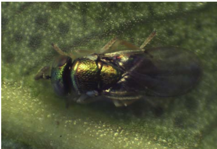
Fig. 2 — Female P. bliteus .