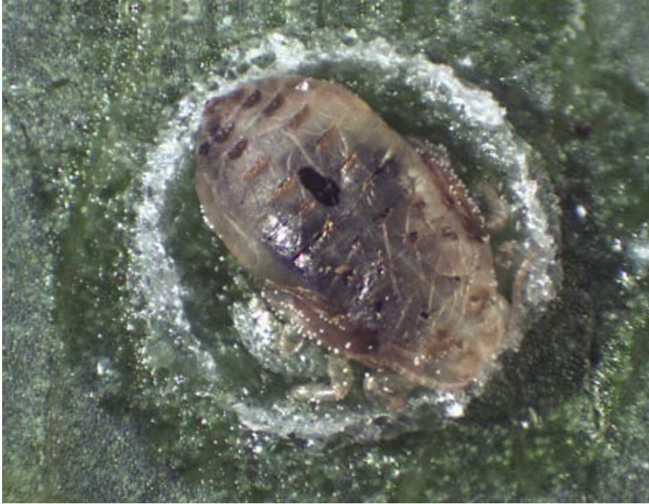
Fig. 4 — Mummy of G. brimblecombei deriving from the transformation of the last instar nymph due to the parasitization by P. bliteus .