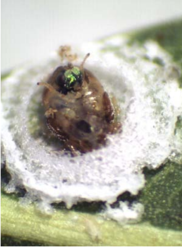
Fig. 5 — Male P. bliteus emerging from a G. brimblecombei mummy.