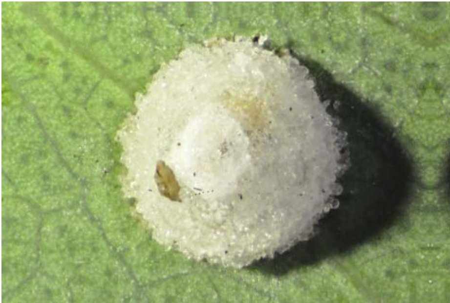
Fig. 3 — Lerp of Glycaspis brimblecombei pierced by an emerging adult of P. bliteus s.

Samplings were carried out in September, October and November in 32 sites of Palermo, Trapani and Agrigento Provinces. Each sample consisted of leaves of Eucalyptus camaldulensis Dehnh. bearing a total number of at least 100 fully developed lerps. Lerps were analysed to detect the exit hole of the parasitoid (Fig. 3). In the laboratory lerps without hole were removed counting the number of parasitized host, in this case called mummies (Fig. 4). The psyllid instars found on the leaves have been reared at room temperature (for about two weeks) until adults emerged. The parasitization level was calculated as the percentage of parasitized psyllid (pierced lerps and unpierced mummies/total collected fully developed lerps).