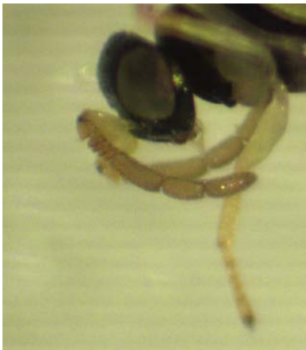
Fig. 1 — Head and prothorax of a male Psyllaephagus bliteus ; four ring segments are clearly visible in the antenna.