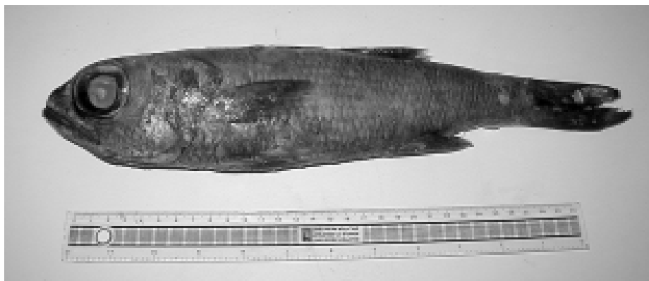
Fig. 2 — Lateral side of Epigonus telescopus from near Filfla.