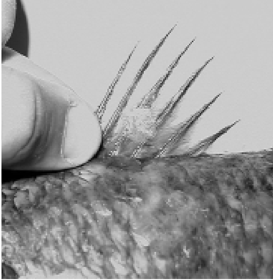
Fig. 3 — Dorsal spines.

Remarks. The specimen now forms part of the National collections at the National Museum of Natural History, Mdina. Malta. It has come to the author's attention that another specimen was caught some days earlier from the same locality by the same person, but this specimen was cooked and eaten.